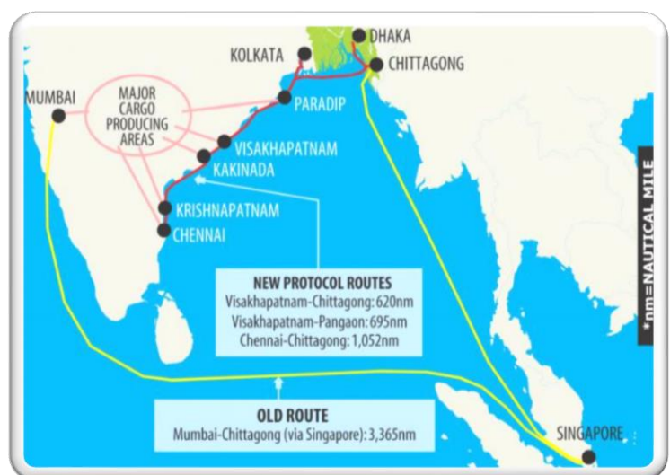
Fig- 2: Agreements for Coastal Shipping