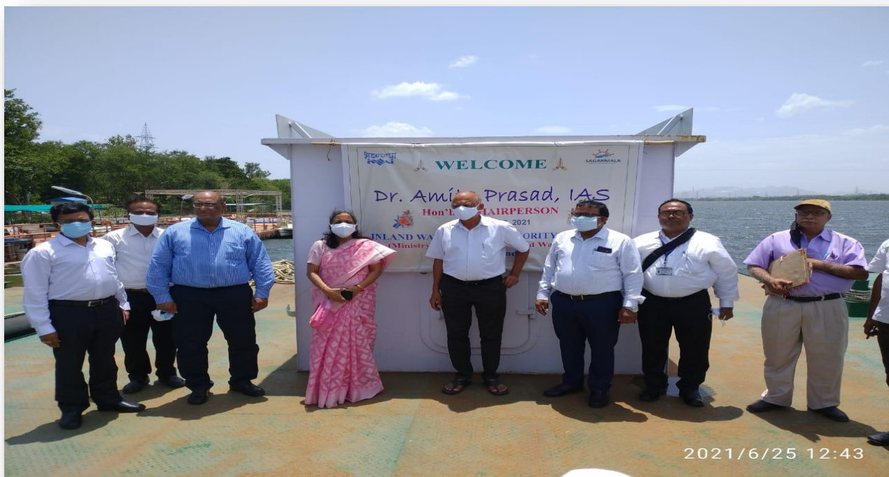
Visit of floating pontoons at Bhavani Island, Vijayawada on NW-4