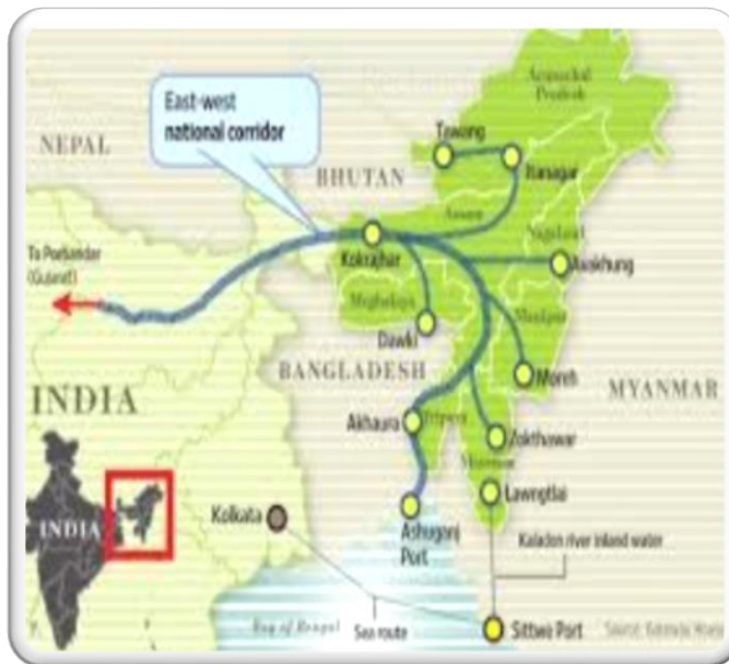
Fig- 2: Chicken Neck Corridor at Siliguri

The Siliguri Corridor known as “ Chicken neck corridor ” being the only bridge between the eight North-Eastern States of India and the rest of the country having rail and road mode of transportation system, this narrow passage assumes strategically important and highly sensitive territory making defence as well a serious challenge. Hence, the protocol routes of Bangladesh have assumed the strategically importance for India in facilitating an alternative mode of passage to NER.