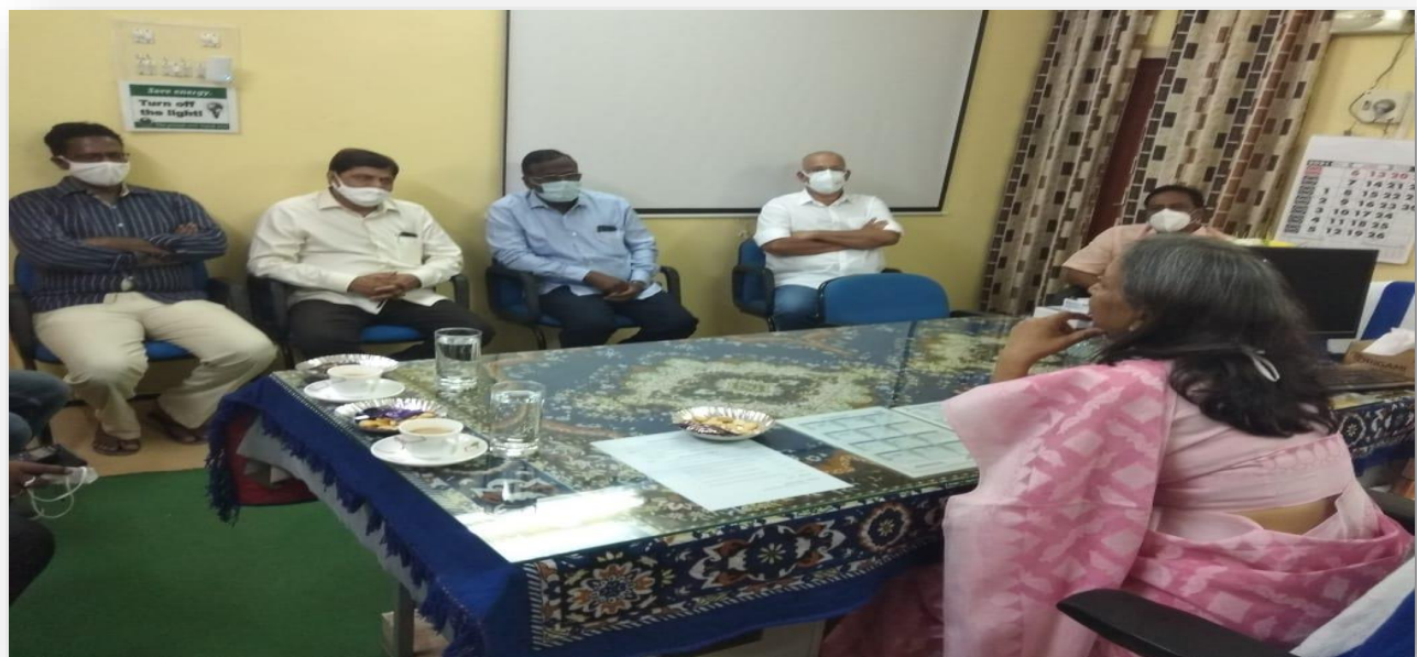
Interaction with local cargo operators for initiation of Ro-Ro service in NW-4