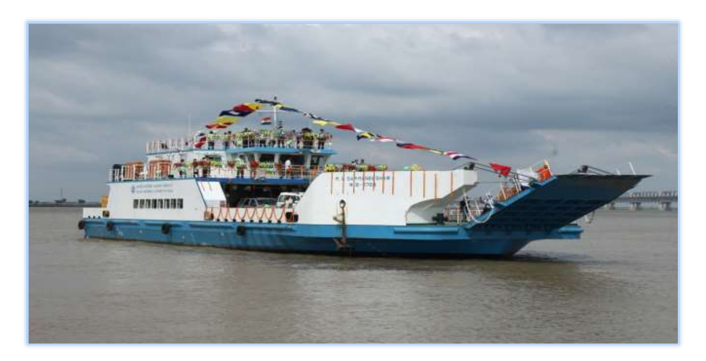
River\ Trip\ of\ Technical\ Committee\ from\ People's\ Republic\ of\ Bangladesh\ at\ Varanasi