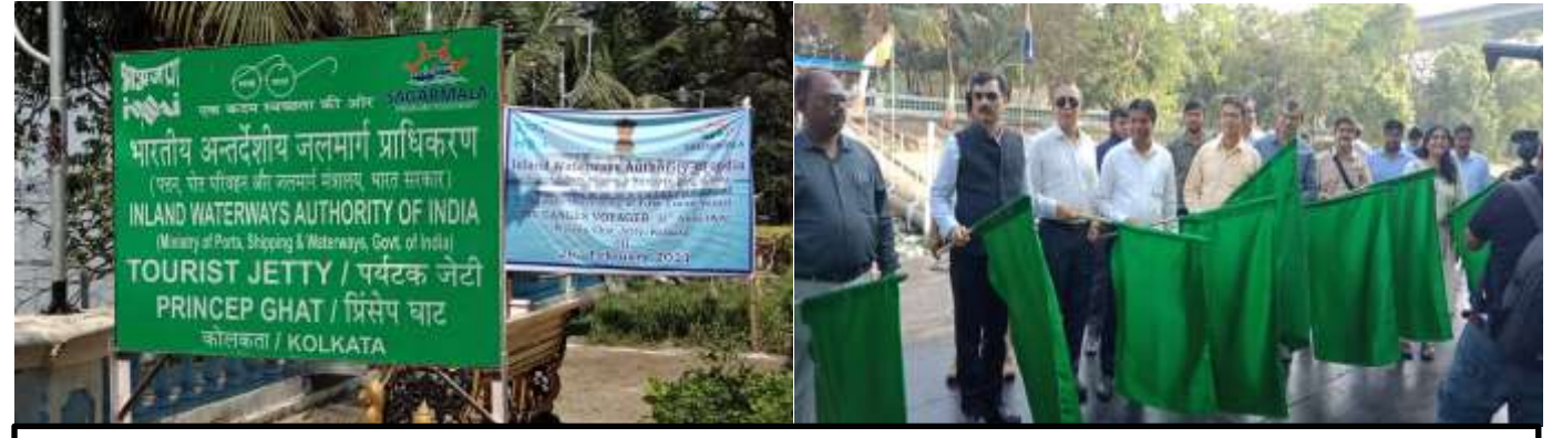
FLAGGING OFF CEREMONY OF FIRST CRUISE VESSEL GANGA VOYAGER-II OF M/S HERITAGE RIVER JOURNEYS FROM IWAI PRINCEP GHAT TOURIST JETTY