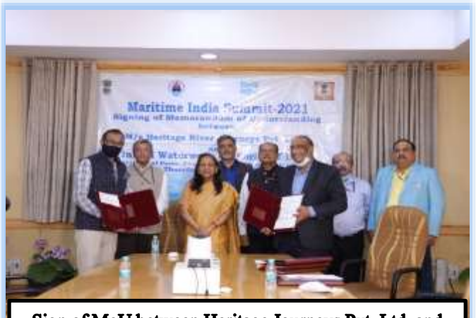
Sign of MoU between Heritage Journeys Pvt. Ltd. and Inland Waterways Authority of India