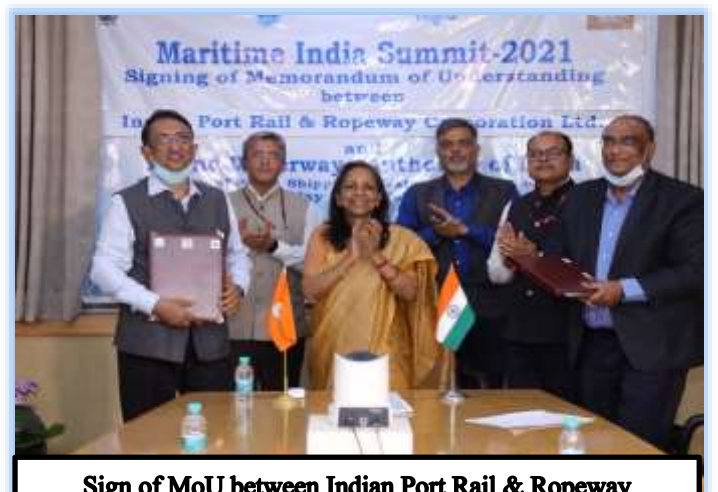
Sign of MoU between Indian Port Rail & Ropeway Corporation Ltd. and Inland Waterways Authority of India