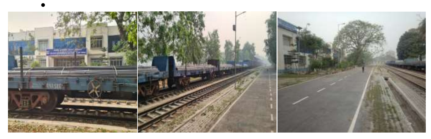
COMMENCEMENT OF COMMERCIAL OPERATION OF BROAD-GAUGE RAILWAY SIDING AT PANDU

Commercial operation of Broad-Gauge Railway Sidingat Pandu commenced by receiving first consignment of 644 MT of steel round bars of Rashtriya Ispat Nigam Limited (RINL)Vizag in 10 wagons on 28.03.2021. An MoU has also been signed between IWAI and North Frontier Railways on 31.03.2021, for jointly utilization of IWAI and Railway infrastructure at Pandu and other locations.