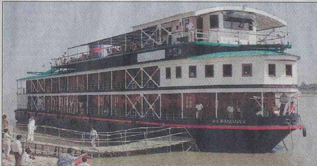
■ The cruise vessel, which reached Varanasi on Sunday.