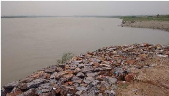
View of the existing shore protection works