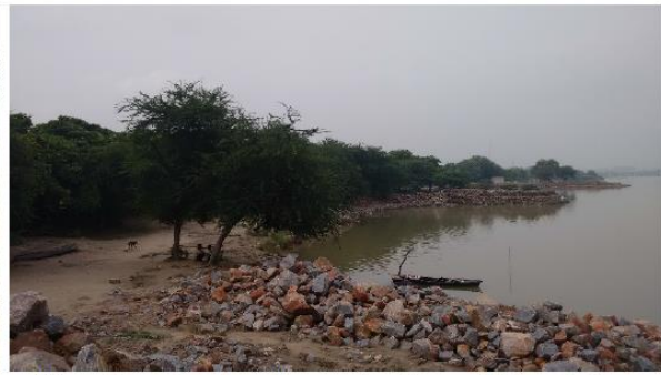
View of ongoing shoreline construction activities at site