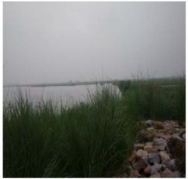
View of the proposed terminal location