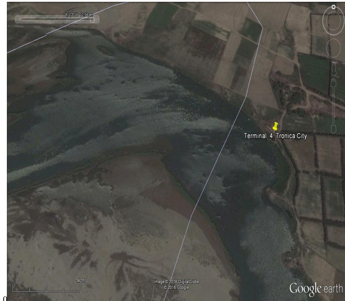
Figure 7. Proposed area for terminal 3