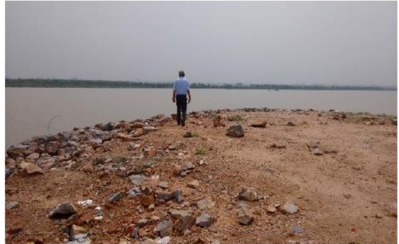
view of the proposed terminal location