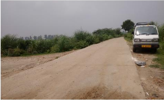
View of the approach road towards the main road