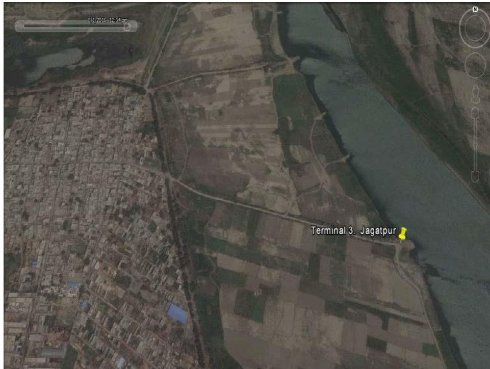
Figure 4. Google Earth imagery of the proposed area for terminal II