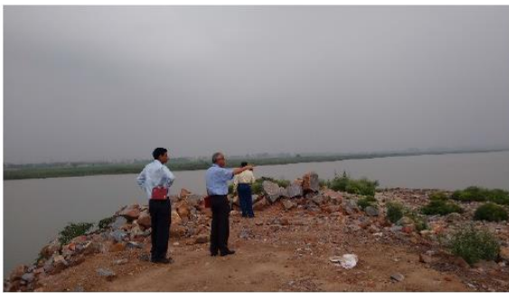
View of proposed terminal location