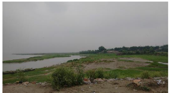
View of grassland patched along the river