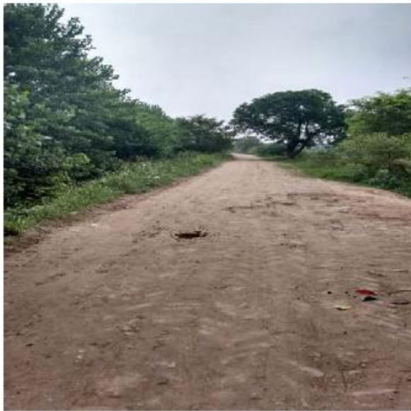
View of approach road towards the main road