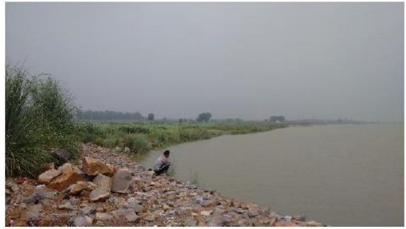
View of the grassland and shore protection at site