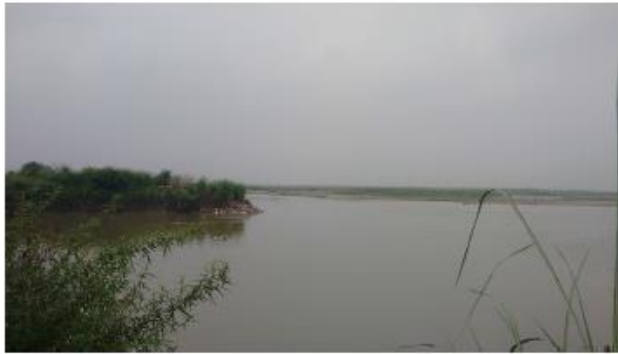
View of river and shore protection at site