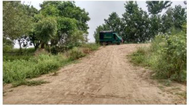
Approach road towards the site