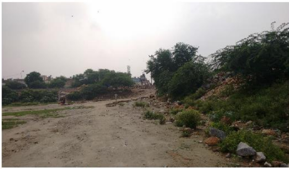
View of approach road