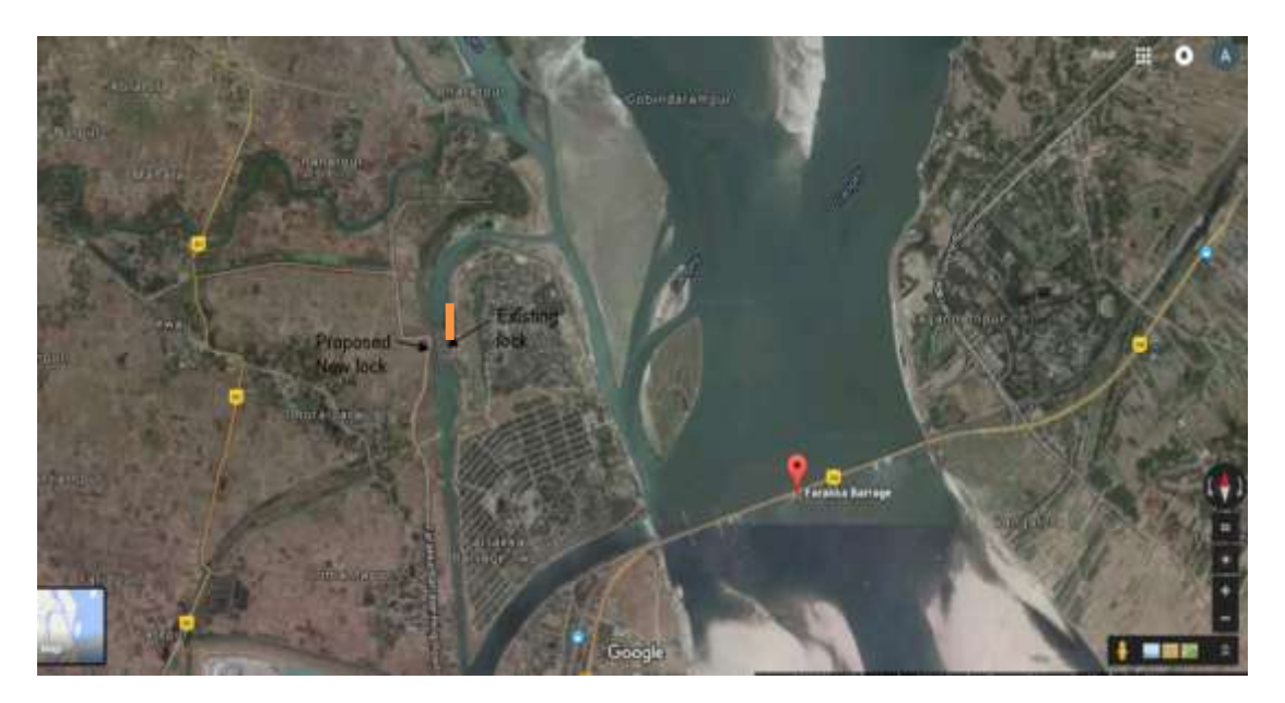
Figure 1: Google Image for New Navigation Lock Proposed and Exisiting Lock at Farakka

The Site is located at Farakka in Murshidabad district of West Bengal, on the Feeder Canal of Farakka Barrage. Google image of the proposed new Navigational Lock and the existing lock is shown in Figure-1.