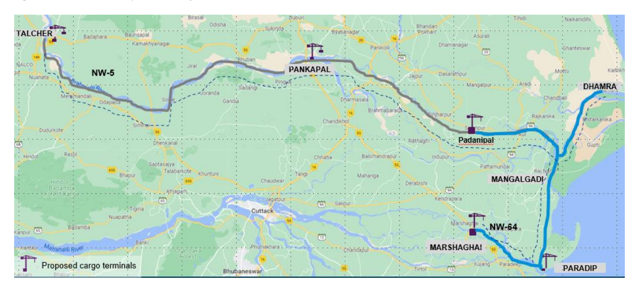
Figure 1: Phased Development Plan for NW-5 and NW-64