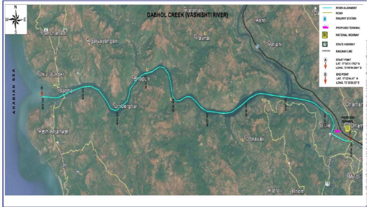
INDEX MAP OF NW-28

4.2.5 The Least Available depth with respect to CD is as follows