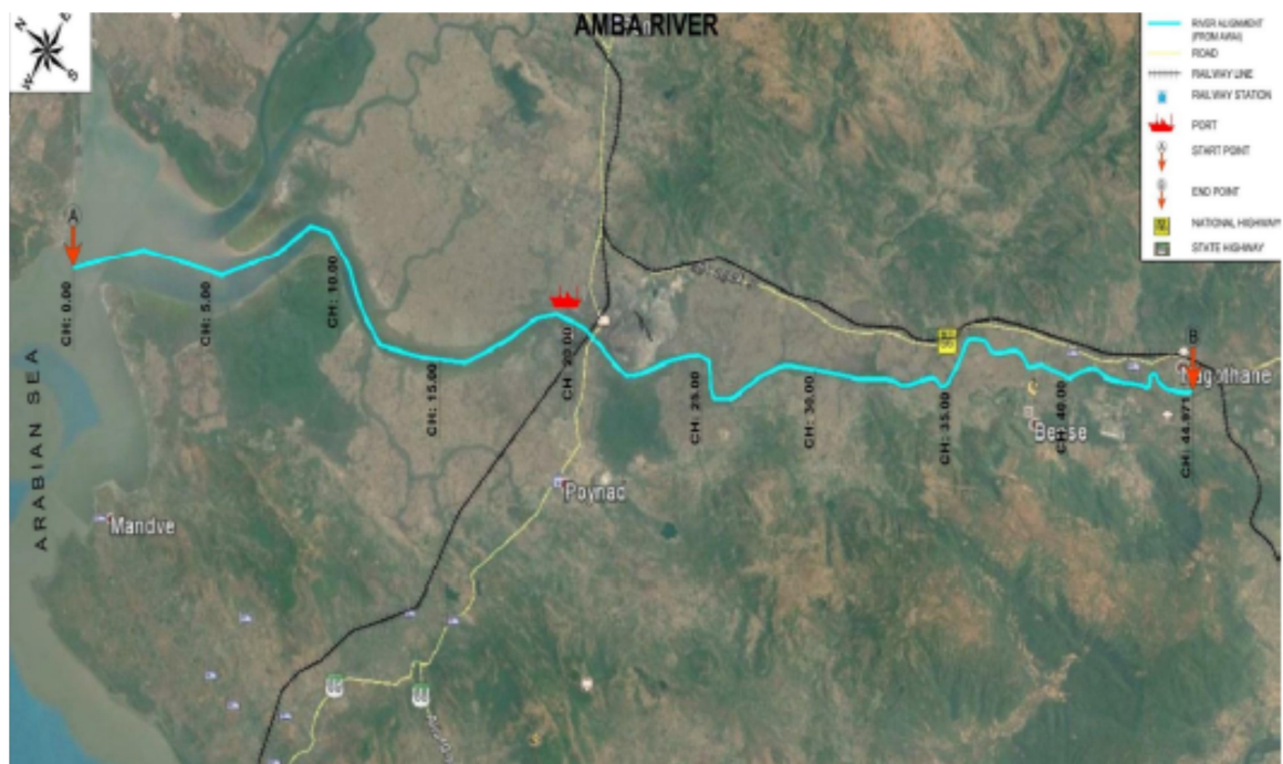
INDEX MAP OF RIVER AMBA (NW-10)

4.1.1 Amba River is one of the waterways declared as National Waterway in March, 2016 as NW 10. The Amba River originates in the Borghat hill of the Sahyadri ranges and joins the Arabian Sea in Dharamatar creek near village Revas duly traversing about 76 Kms. The declared stretch of the river is of about 45 km length from Arabian Sea, Dharamatar Creek near village Revas to a Bridge near Nagothane ST Stand. The river is tidal in its entire reach with an average tidal variation of 3.73 m.