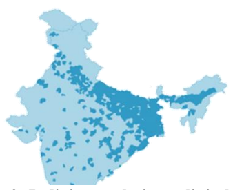
Figure 2: India's population split in half

2.1 India, with a huge network of rivers and interconnecting canals is ideal for an efficient inland waterways system which has multifarious advantages and is the cheapest mode of transportation. However, this potential could not be tapped to its full extent as development of inland waterways as a means for passenger & cargo transportation, had not been a focus area till recently.