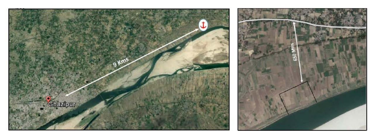
Figure 1: Location of Ghazipur IMT/Bunkering Facility/SRF

The proposed site for infrastructure development at Ghazipur is located at latitude 25° 37' 19.58" north and longitude 83° 39' 50.23" east, in Ghazipur district, Uttar Pradesh. An area of about 15 acres (6 Ha) will be available for the proposed shore-side infrastructure development.