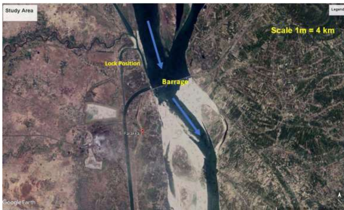
Figure 2 Plan Map of Farakka Barrage and Navigational lock